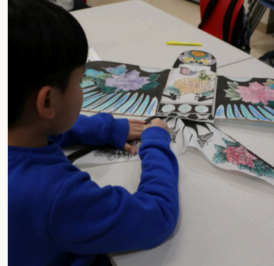
Explore a Kite 研究风筝