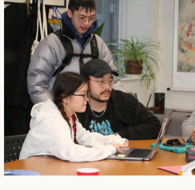
TAs and Staff 助教与工作人员