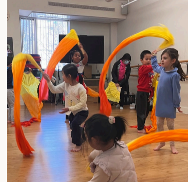
Movement Class 运动时间