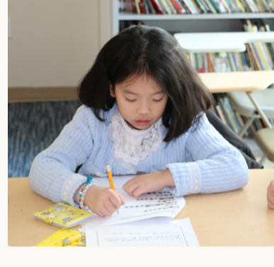
Academic Enrichment 学业辅导