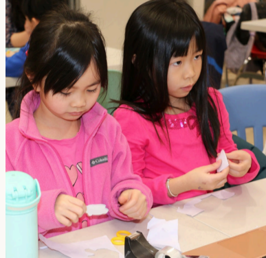
Handcrafts Project 折纸